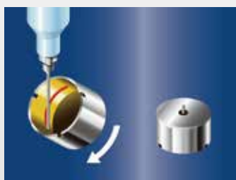
Dispensing of 2-part epoxy adhesive to motors