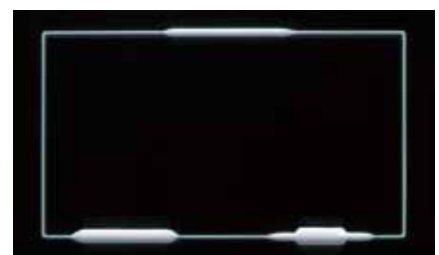
Line width variable in an instant