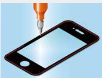
Sealant dispensing of PUR for smartphone's cover