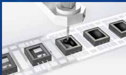
Potting sensor components