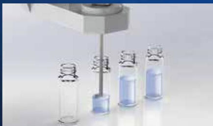
Dispensing into vial bottles